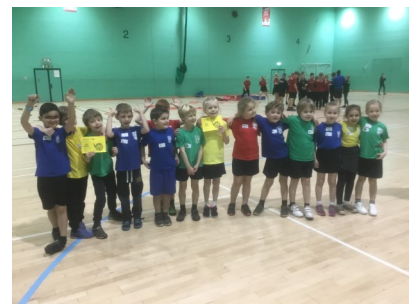
Maple Class SSP Infant Agility